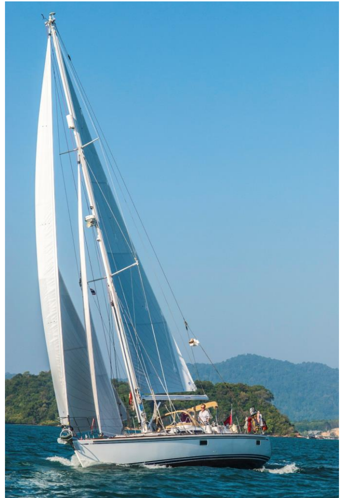
Adina is equipped with electric in-mast furling, electric genoa furler and electric winches and North Sails NPL Tour Norlam Xi laminate sails (new in 2016)